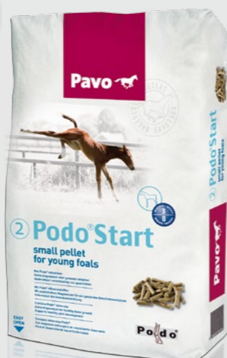
Pavo Podo®Start - for the young foal