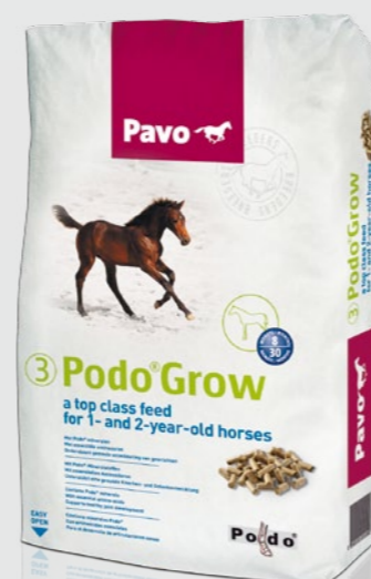
Pavo Podo®Grow - for the developing horse