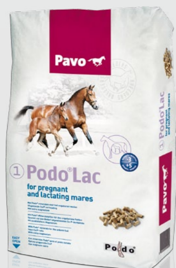
Pavo Podo®Lac - for the mare