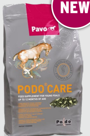
Pavo Podo®Care - for young foals up to the age of 12 months